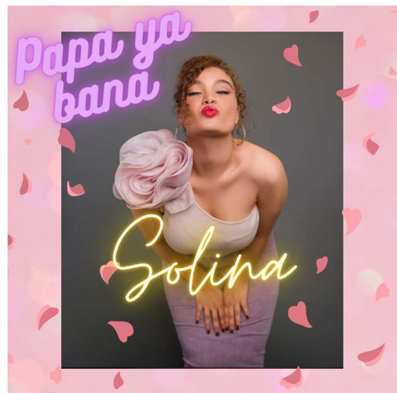
Papa Ya Bana

Out now on Spotify, YouTube, Apple Music and all other streaming platforms.